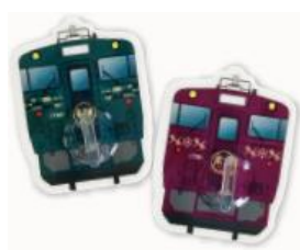
(An example of original goods)