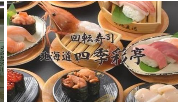
Kaiten-Sushi Hokkaido Shikisai-tei