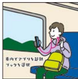
Activate the application on the train Select a book