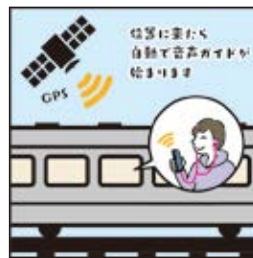
When you reach the place of interest you have chosen, audio guide starts automatically.