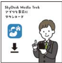
Download SkyDesk Media Trek application in advance