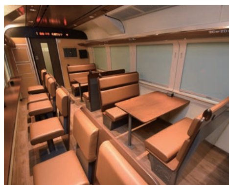
“Hamanasu Lounge” (Free space)

A place for holding an event etc. You can use the lounge as a group as well as an individual.