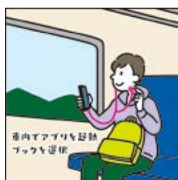
Activate the application on the train Select a book