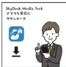
Download SkyDesk Media Trek application in advance