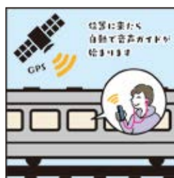
When you reach the place of interest you have chosen, audio guide starts automatically.