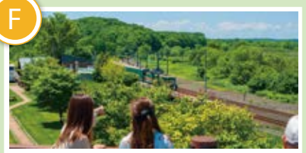
Shibecha Museum "Nita-to" (About 15 mins walk from Toro Sta)

You can enjoy breathtaking scenery depending on the season and time.