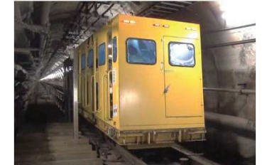
Cable car at the Yoshioka Fixed Point

You also can walk to the ground level as there are stairs by the railway tracks for cable car.