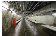
Evacuation spot (Tappi)