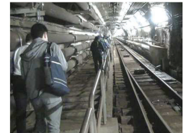
Stairs by railway tracks for cable car